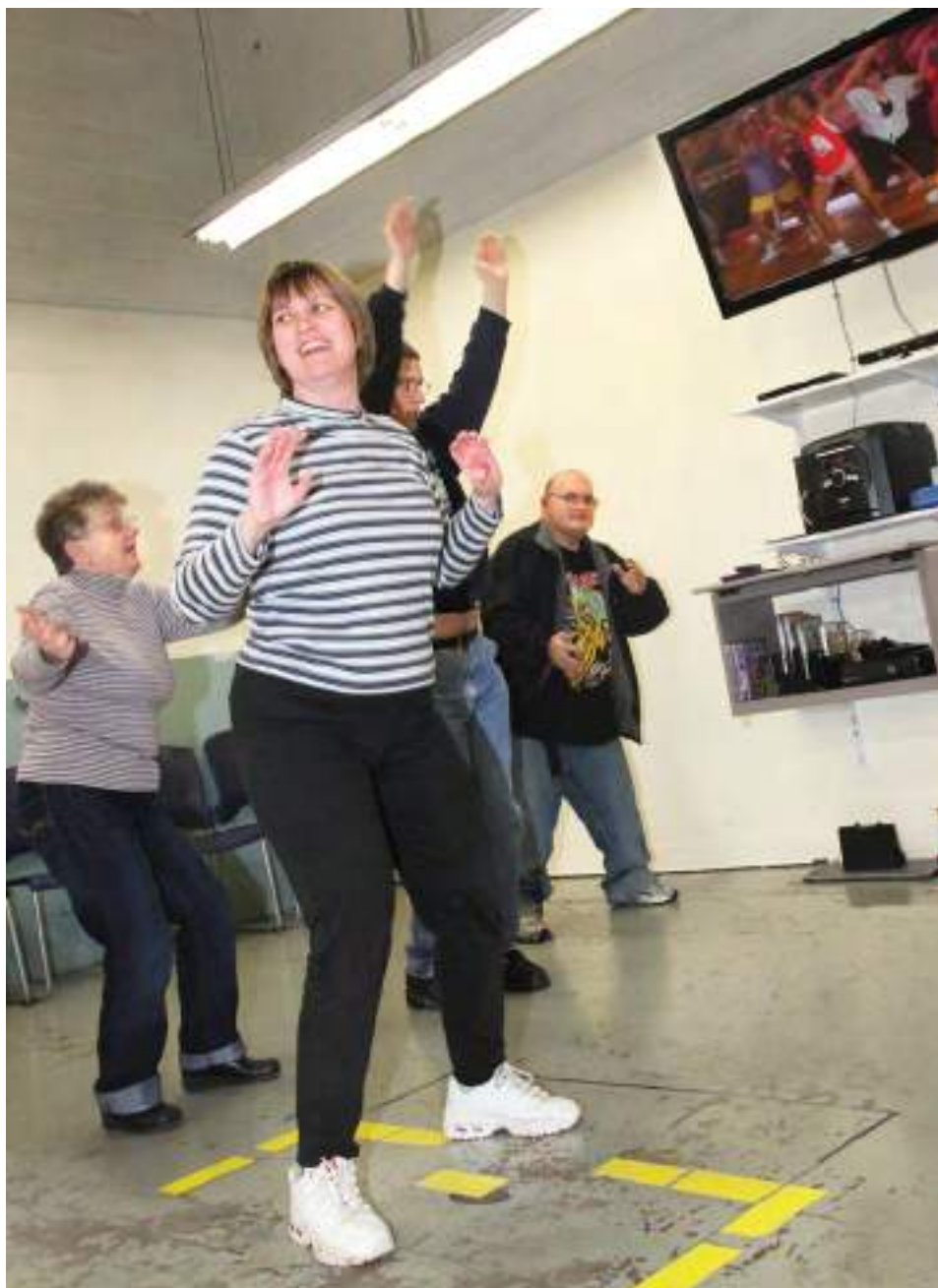
Exercise is an essential part of daily activities at Penn-Mar's Job Training Center. Movement Therapy helps everyone stay limber and focused.