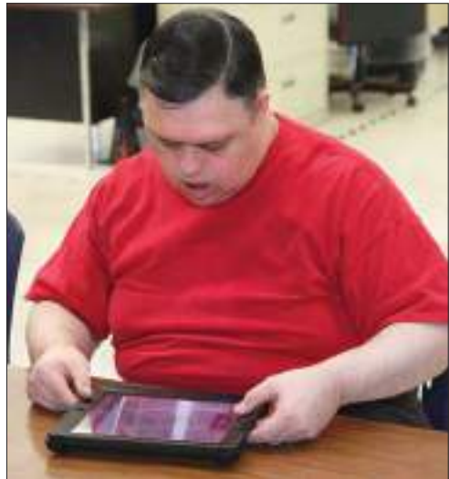
Penn-Mar is incorporating the latest technology to transform life into living every day.

During the 2013 Fiscal Year, Penn-Mar's Endowment doubled in size. Multiple sources contributed to this growth, including the quiet stage of our endowment campaign. During FY 2014 you will see an increased level of public information regarding this initiative.