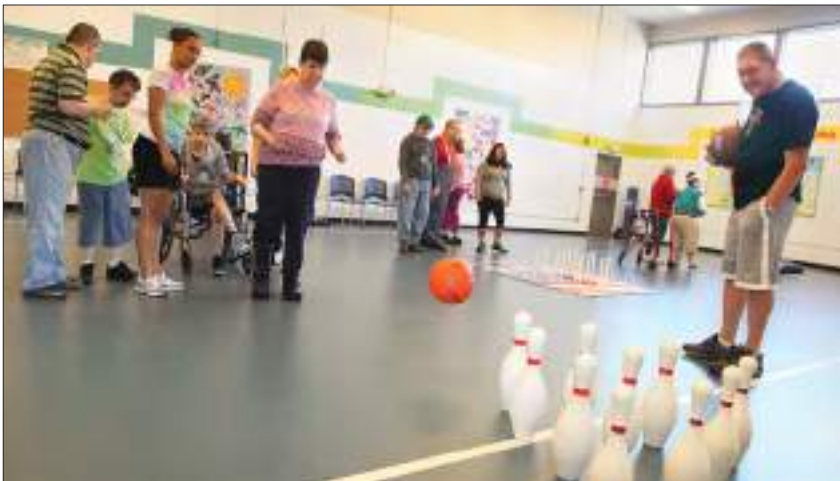
Recreational activities at Maryland Line.

Respite: Families providing primary care for loved ones with intellectual disabilities inevitably encounter situations where a family must be separated for brief periods. Penn-Mar's Respite Program provides adults and children with intellectual disabilities with a place to stay on such occasions and family members with peace of mind knowing their children are in good hands.