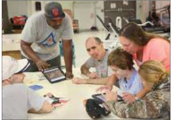
iPads opening a new range of learning capabilities.

This does not mean their lives at Penn-Mar will become a predictable and repetitious daily routine. Just as the Employment First Initiative identifies job skills and interests, Penn-Mar's Day Program works to discover the aspirations and ambitions of the adults who are free to pursue a range of established interests and discover new ones.